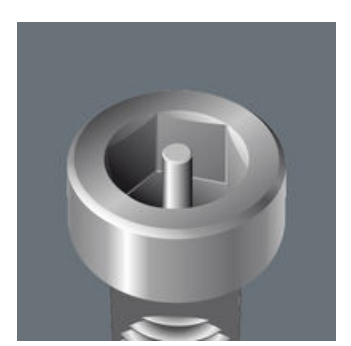
For hexagon socket screws with safety pin.