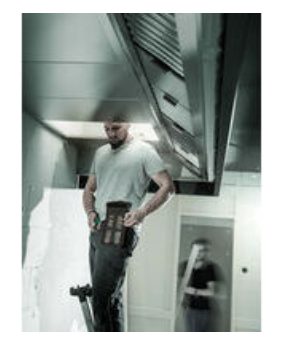
The Kraftform Kompakt 60 Tool finder bit set with 89 mm long colour-coded Take it easy bits.