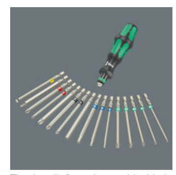
The handle/interchangeable blade system allows rapid exchange of the blades required for a wide range of applications.