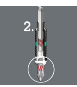
Higher peak loads are minimised through the torsion effect of the bit shaft (Phase 2).