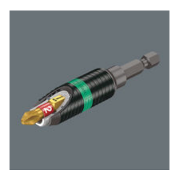
The BiTorsion holder and the BiTorsion bit can, of course, be used independently of one another.