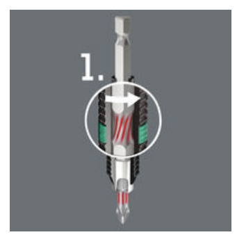
The torsion spring integrated into the unique BiTorsion holder absorbs lower levels of peak loads (Phase 1). Any overloading of this spring is effectively prevented by means of a supporting mechanism.