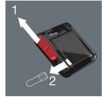
The slide switch allows a simple and gradual removal and reinsertion of the bits. The transparent reverse side means that it is easy to know how many bits are still in the box.