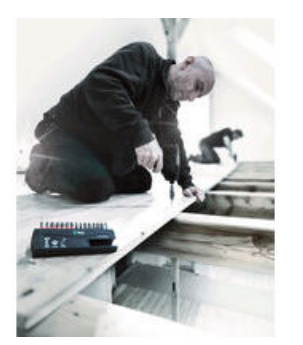
Impaktor technology for an aboveaverage service life even under extreme demands