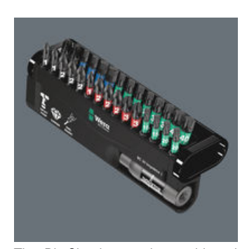
The Bit-Checks can be positioned upright at the workplace so the tool is always quickly to hand.