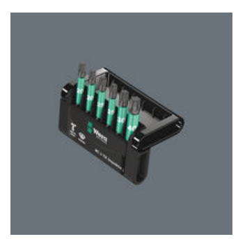
The Bit-Checks can be positioned upright at the workplace so the tool is always quickly to hand.