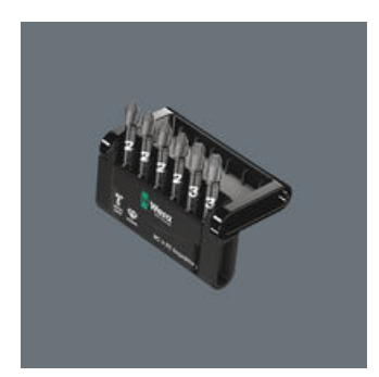
The Bit-Checks can be positioned upright at the workplace so the tool is always quickly to hand.