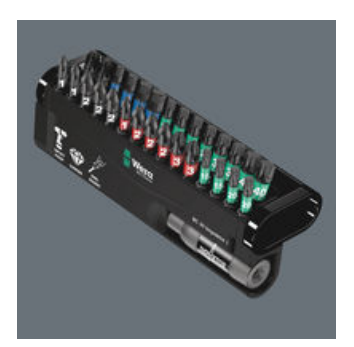
The Bit-Checks can be positioned upright at the workplace so the tool is always quickly to hand.