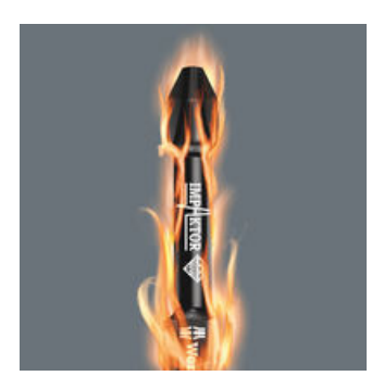
Maximum utilisation of material properties, a very special geometry - designed particularly to meet the extreme demands - as well a specific manufacturing process mean that Wera Impaktor tools have an above-average service life.