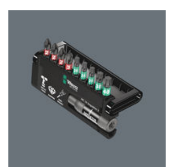
The Bit-Checks can be positioned upright at the workplace so the tool is always quickly to hand.