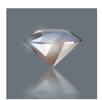
Another product advantage is the coating of the Impaktor bits with minute diamond particles.