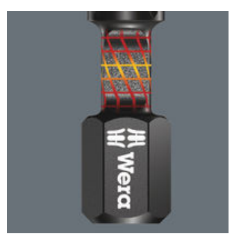
Torsion zone specially designed to absorb such forces and thereby protect the bit tip.