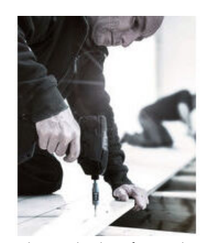
Impaktor technology for an aboveaverage service life even under extreme demands