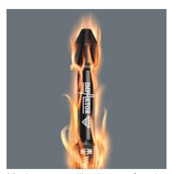
For use with impact screwdrivers. Improve productivity when screwdriving with power tools.

Maximum utilisation of the material properties, a very special geometry - designed particularly to meet the extreme demands - as well a specific manufacturing process mean that Wera Impaktor tools have an above-average service life.