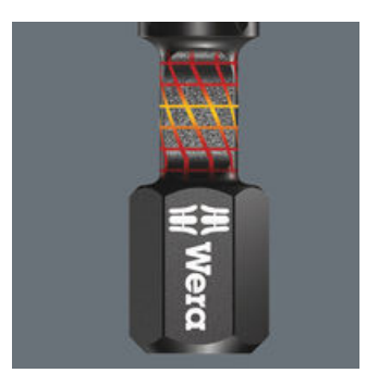
Torsion zone specially designed to absorb such forces and thereby protect the bit tip.