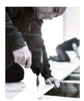
Impaktor technology for an aboveaverage service life even under extreme demands