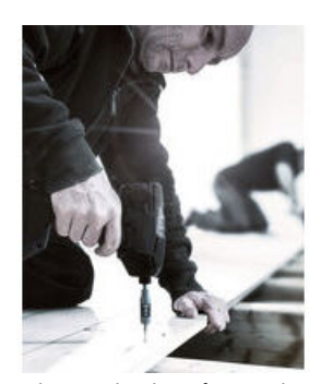
Impaktor technology for an aboveaverage service life even under extreme demands