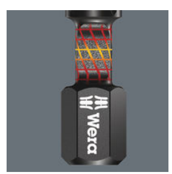
Torsion zone specially designed to absorb such forces and thereby protect the bit tip.