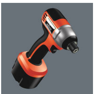
For use with impact screwdrivers. Improve productivity screwdriving with power tools.

For an above-average service life. Maximum utilisation of the material properties, a very special geometry - designed particularly to meet the extreme demands - as well a specific manufacturing process mean that Wera Impaktor tools have an above-average service life. Another product advantage is the coating of the Impaktor bits with minute diamond particles. These diamond particles reduce the cam-out effects particularly high in power tool applications - which can lead to a slipping out of the screw head. The diamond particles literally bite themselves into the screw recess. This means that less contact pressure is required, something that greatly delays fatigue settingin in power tool screwdriving jobs.