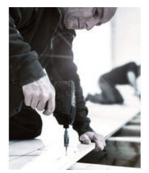
Impaktor technology for an aboveaverage service life even under extreme demands