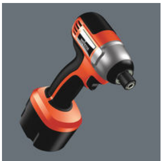
For use with impact screwdrivers. Improve productivity screwdriving with power tools.

For an above-average service life. Maximum utilisation of the material properties, a very special geometry - designed particularly to meet the extreme demands - as well a specific manufacturing process mean that Wera Impaktor tools have an above-average service life. Another product advantage is the coating of the Impaktor bits with minute diamond particles. These diamond particles reduce the cam-out effects particularly high in power tool applications - which can lead to a slipping out of the screw head. The diamond particles literally bite themselves into the screw recess. This means that less contact pressure is required, something that greatly delays fatigue settingin in power tool screwdriving jobs.