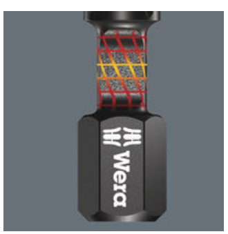
Torsion zone specially designed to absorb such forces and thereby protect the bit tip.