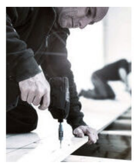
Impaktor technology for an aboveaverage service life even under extreme demands