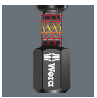
Torsion zone specially designed to absorb such forces and thereby protect the bit tip.