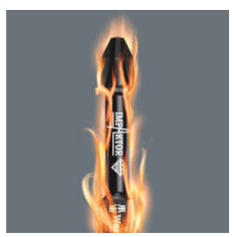
For use with impact screwdrivers. Improve productivity when screwdriving with power tools.

Maximum utilisation of the material properties, a very special geometry - designed particularly to meet the extreme demands - as well a specific manufacturing process mean that Wera Impaktor tools have an above-average service life.