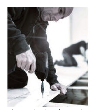
Impaktor technology for an aboveaverage service life even under extreme demands