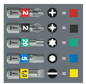
"Take it easy" tool finder with colour coding according to profiles and size stamp - for simple and rapid accessing of the required tool.