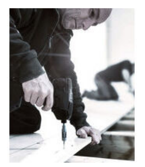
Impaktor technology for an aboveaverage service life even under extreme demands