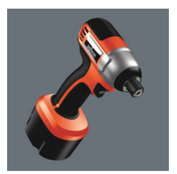
For use with impact screwdrivers. Improve productivity when screwdriving with power tools.

For an above-average service life. Maximum utilisation of the material properties, a very special geometry - designed particularly to meet the extreme demands - as well a specific manufacturing process mean that Wera Impaktor tools have an above-average service life. Another product advantage is the coating of the Impaktor bits with minute diamond particles. These diamond particles reduce the cam-out effects particularly high in power tool applications - which can lead to a slipping out of the screw head. The diamond particles literally bite themselves into the screw recess. This means that less contact pressure is required, something that greatly delays fatigue settingin in power tool screwdriving jobs.