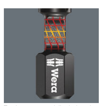
Torsion zone specially designed to absorb such forces and thereby protect the bit tip.