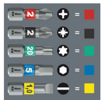
"Take it easy" tool finder with colour coding according to profiles and size stamp - for simple and rapid accessing of the required tool.

Hexagon socket screws are a problem, because the contact surfaces that transfer the force of the tool to the screw are very narrow. The consequence: the head of the screw can be damaged, usually rounding out the recess. Hex-Plus tools have larger contact surfaces to prevent this, driving from the flats of the recess, rather than the corners. Good to know: Hex-Plus tools fit into every standard hexagon socket screw!