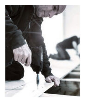
Impaktor technology for an aboveaverage service life even under extreme demands