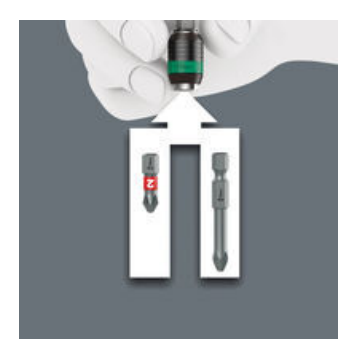
The Rapidaptor quick-release chucks hold ¼" DIN ISO 1173-C 6,3 and E 6,3 as well as Wera series 1 and 4 bits.