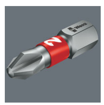
With BiTorsion zone to cushion peak loads.