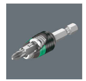
Rapid bit change without needing any additional tools. One-hand operation with a freely spinning sleeve for simplified guidance of the tool.