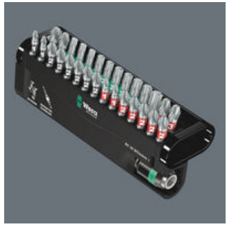
The Bit-Checks can be positioned upright at the workplace so the tool is always quickly to hand.