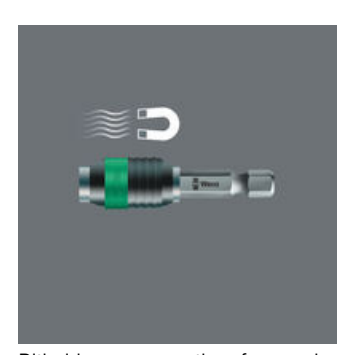
Bitholders, magnetic, for easier application of the screw