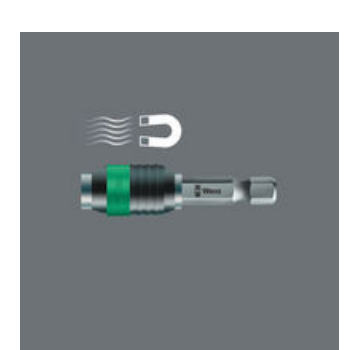
Bitholders, magnetic, for easier application of the screw