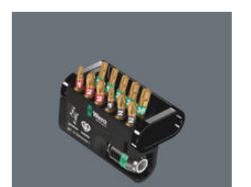
The Bit-Checks can be positioned upright at the workplace so the tool is always quickly to hand.