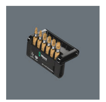
The Bit-Checks can be positioned upright at the workplace so the tool is always quickly to hand.