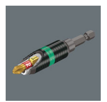
The BiTorsion holder and the BiTorsion bit can, of course, be used independently of one another.