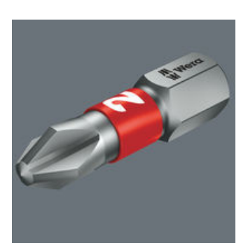
With BiTorsion zone to cushion peak loads.