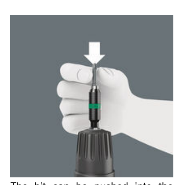
The bit can be pushed into the adaptor without moving the sleeve. The lock is activated automatically as soon as the bit is applied to the screw. Bits are held securely and wobble-free.