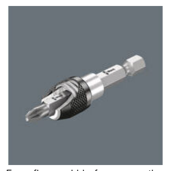
For a firm, wobble-free connection between holder and bit with quickrelease action. Simply push sleeve forward to change bits. The magnetic design enables simplified positioning of the screw.