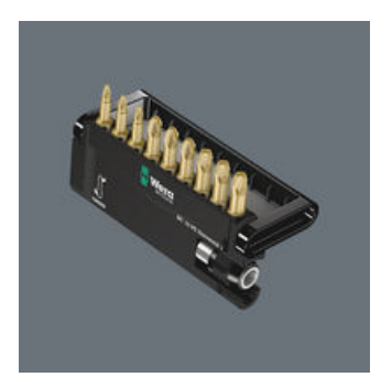
The Bit-Checks can be positioned upright at the workplace so the tool is always quickly to hand.