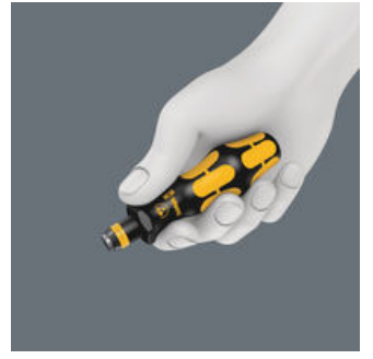
The outstanding design of the Kraftform handle that fits perfectly into the hand prevents hand injuries such as blisters and calluses.

The basic idea for the prototype of the Kraftform handle - that the hand should dictate the design has, right through to today, proved to be correct. In cooperation with the internationally recognised Fraunhofer IAO Institute, Wera developed a screwdriver handle designed to match the shape of the human hand as long ago as the 1960s. After а long development phase, the Wera Kraftform handle was launched to the market in 1968. It has been optimised through the years with new technologies, but has kept its proven shape. After all, the human hand has not changed either.