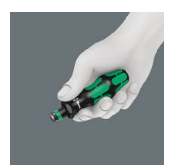
The outstanding design of the Kraftform handle that fits perfectly into the hand prevents hand injuries such as blisters and calluses.

Hexagon screws can endure a problem because the contact surfaces delivering the power from the conventional tool, is transferred to the screw via very small surface areas. The consequence: the screw can become damaged (rounding out). Hex-Plus tools have a greater contact surface that prevents this from happening! At the same time, as much as 20 % more torque can be applied. Good to know: Hex-Plus tools fit into every standard hexagon socket screw!