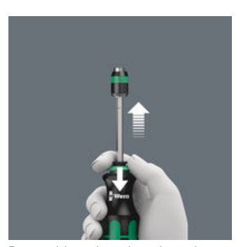
By pushing the clamping sleeve, the telescopic blade can be extended out of the handle and the compact tool becomes a full-sized screwdriver.