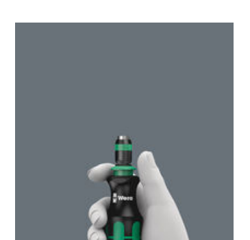
When the unique telescopic blade is lowered into the handle, fast, easy screw-driving action is possible, even in the tightest spots!