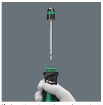
If the clamping sleeve is pushed again the telescopic blade can be taken out of the handle, and be used as a machine bit adaptor.