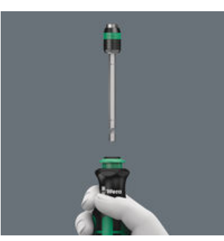
If the clamping sleeve is pushed again the telescopic blade can be taken out of the handle, and be used as a machine bit adaptor.