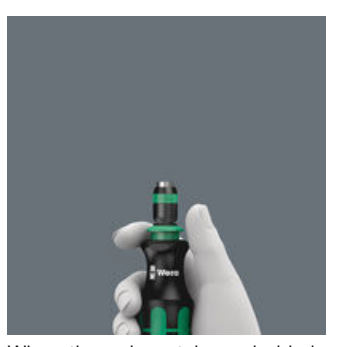
When the unique telescopic blade is lowered into the handle, fast, easy screw-driving action is possible, even in the tightest spots!