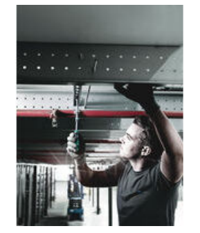
Why is the right tool so often not at hand? The reason: too many tools and overly-heavy tool bags can make it bothersome to carry them onsite. So for us it was a clear challenge: to design a tool that is suitable for a whole host of applications and can be easily taken along to jobs at other sites. Our solution: Kraftform Kompakt tools. A handle into which blades with a range of different profiles can be inserted. Compactly and protectively housed in a light and robust textile pouch or plastic box.

Telescopic blade, integrated bit magazine, Rapidaptor technology