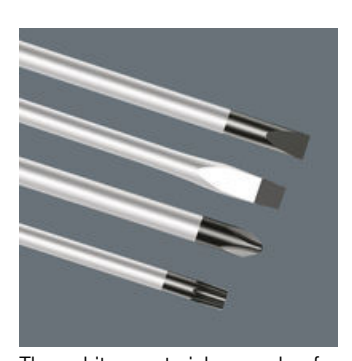
The bit material used for manufacturing is subjected to a specific Wera hardening process, and this ensures longer product service life.