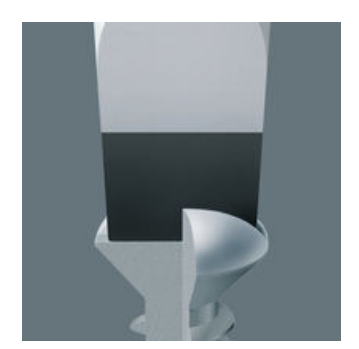
The Wera Black Point tip and a refined hardening process ensure long service life of the tip, improved corrosion protection and an exact fit.