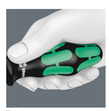
The large contact area - with particularly high friction to the soft zones - results in high torque transfer without any bruising from the edges.