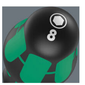
The screw symbol and tip size identification markings on the handle make it easier to find the right screwdriver in the tool case, or at the workplace.

Web link https://products.wera.de/en/screwdrivers_kraftform_plus__series_300_395_ho.html