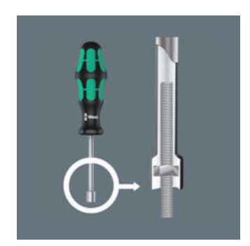
A screwdriver with a hollow shaft is needed whenever there are screwdriving jobs involving threaded rods i.e. the threaded rod through the nut can slip into the hollow shaft of the screwdriver.