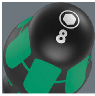
The screw symbol and tip size identification markings on the handle make it easier to find the right screwdriver in the tool case, or at the workplace.