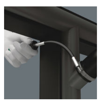
Screwdriving can also be achieved "around the corner" with the screwdriver 392. The flexible shaft allows unfavourably-positioned screw fastenings to be reached. The ideal tool for difficult-toaccess screwdriving applications e.g. in the engine compartment of a car.