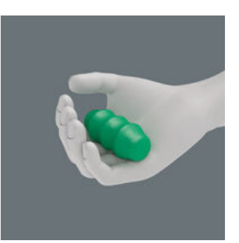
The basic idea for the prototype of the Kraftform handle - that the hand should dictate the design has, right through to today, proved to be correct. In cooperation with the internationally recognised Fraunhofer IAO Institute, Wera developed a screwdriver handle designed to match the shape of the human hand as long ago as the 1960s. After a long development phase, the Wera Kraftform handle was launched to the market in 1968. It has been optimised through the years with new technologies, but has kept its proven shape. After all, the human hand has not changed either.