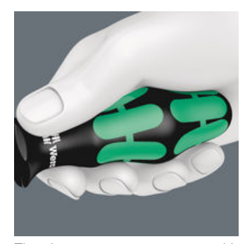
The large contact area - with particularly high friction to the soft zones - results in high torque transfer without any bruising from the edges.