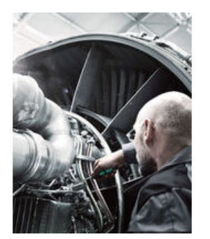
Kraftform Plus screwdrivers ergonomics you can grasp. They relieve the entire hand-arm system even when used intensively. Along with other technical and product advantages such as the Lasertip for a secure fit in the screw head, Kraftform screwdrivers are the ideal choice whenever manual screwdriving jobs are concerned.