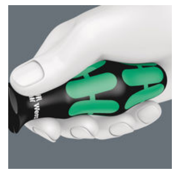
The large contact area - with particularly high friction to the soft zones - results in high torque transfer without any bruising from the edges.