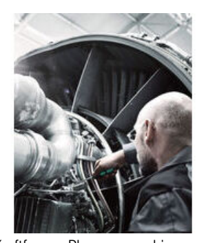
Kraftform Plus screwdrivers ergonomics you can grasp. They relieve the entire hand-arm system even when used intensively. Along with other technical and product advantages such as the Lasertip for a secure fit in the screw head, Kraftform screwdrivers are the ideal choice whenever manual screwdriving jobs are concerned.