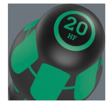
The screw symbol and tip size identification markings on the handle make it easier to find the right screwdriver in the tool case, or at the workplace.