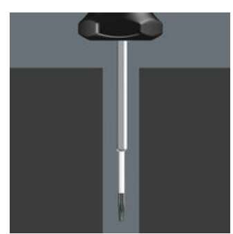
Slim 4 mm hexagon blades to reach screws in difficult-to-access places.