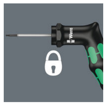
Non-adjustable and tamperproof.