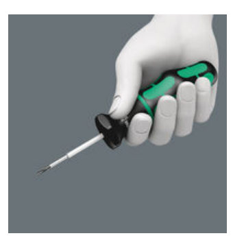
Multi-component Kraftform handle with hard and soft zones for fast working speeds and protecting the palm of the hand.

Web link https://products.wera.de/en/torque_tools_series_torque-indicators_300_hex.html Wera - 300 Hex