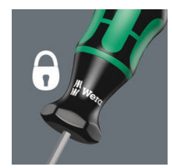
Non-adjustable and tamperproof.