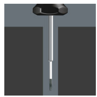
Slim 4 mm hexagon blades to reach screws in difficult-to-access places.