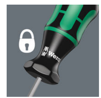
Non-adjustable and tamperproof.