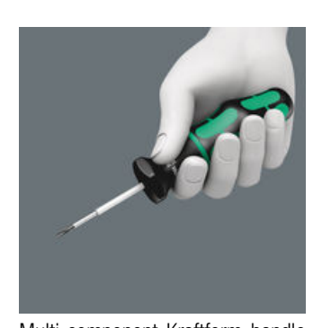
Multi-component Kraftform handle with hard and soft zones for fast working speeds and protecting the palm of the hand.

Web link https://products.wera.de/en/torque_tools_series_torque-indicators_300_hex.html Wera - 300 Hex 05027911001 - 4013288096432