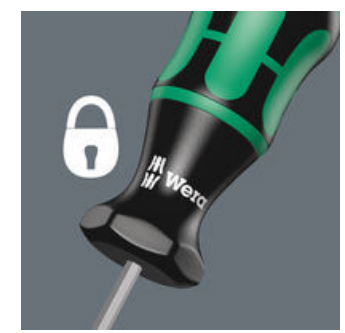
Non-adjustable and tamperproof.