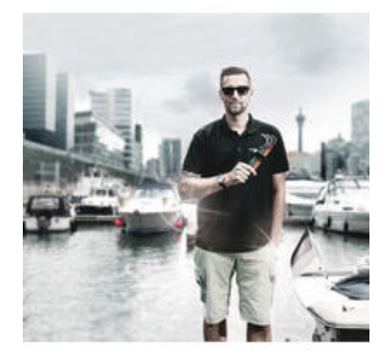
We questioned the classic L-key design, since all too often the screw head recess is rounded out, meaning screws can no longer be tightened or loosened - and so the user finds the L-key slipping out of the recess. Wera Hex-Plus tools have a larger contact surface in the screw head. The notching effects are reduced and thereby the deformation of the screws. At the same time, as much as 20 %more torque can be applied.