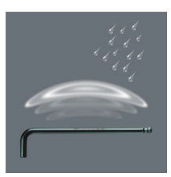
L-keys with BlackLaser surface treatment for outstanding surface protection and long service life. High corrosion protection.