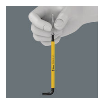
The HF tools developed by Wera are ideal because they feature an optimised geometry of the original TORX® profile. The wedging forces resulting from the surface pressure between the drive tip and the screw profile mean that TORX® screws made according to Acument Intellectual Properties specifications are securely held on the tool!