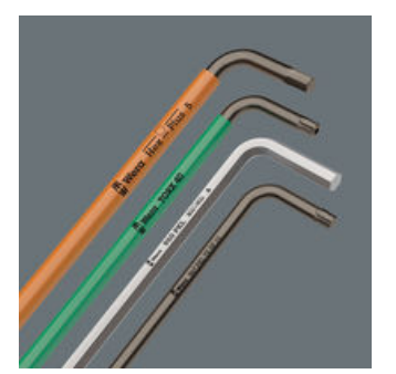
The size of each L-keys has been engraved by a laser. In addition Take it easy L-keys have a colour coding according to sizes - for simple and rapid accessing of the required tool. Making it easy to find the right tool.