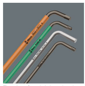
The size of each L-keys has been engraved by a laser. In addition Take it easy L-keys have a colour coding according to sizes - for simple and rapid accessing of the required tool. Making it easy to find the right tool.