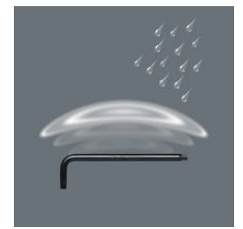
L-keys with BlackLaser surface treatment for outstanding surface protection and long service life. High corrosion protection.