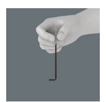
In tight assembly or disassembly situations, for example in engine compartments, it is not possible to securely hold the screw with the hand on the screwdriver, and the screw subsequently often gets lost. Lengthy searches or the loss of the screw (with the associated danger that could bring about) are the consequence. The HF tools developed by Wera are ideal because they feature an optimised geometry of the original TORX® profile. The wedging forces resulting from the surface pressure between the drive tip and the screw profile mean that the screw is securely held on the tool!

Further versions in this product family: