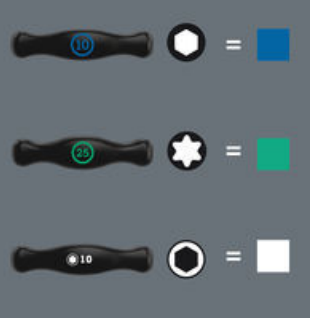
Screwdrivers with "Take it easy" tool finder: colour coding according to profile and size stamp.