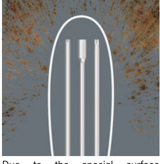
Due to the special surface treatment, the blades receive a high level of corrosion protection. The optimum fitting accuracy of the screw is also guaranteed.