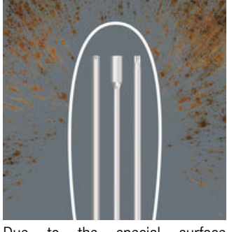
Due to the special surface treatment, the blades receive a high level of corrosion protection. The optimum fitting accuracy of the screw is also guaranteed.