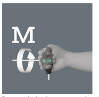
By using the blade as an extension of your lower arm you can transfer particularly high torque.