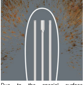
Due to the special surface treatment, the blades receive a high level of corrosion protection. The optimum fitting accuracy of the screw is also guaranteed.