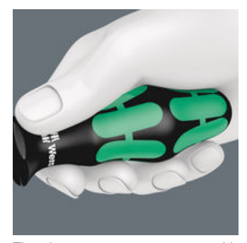
The large contact area - with particularly high friction to the soft zones - results in high torque transfer without any bruising from the edges.