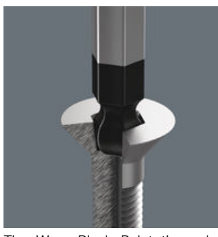
The Wera Black Point tip and a refined hardening process ensure long service life of the tip, improved corrosion protection and an exact fit.