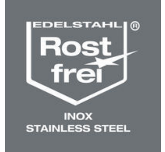
Stainless L-keys are hardened to the same strength as conventional (carbon) steel tools, and prevent extraenous rust forming.