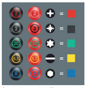
Screwdrivers with "Take it easy" tool finder: colour coding according to profile and size stamp.