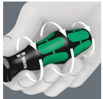
The hard materials used for the handle ensure rapid hand repositioning without any danger of the skin "sticking" to the handle. The surrounding hard zones with large diameters glide like wheels through the hand.

The basic idea for the prototype of the Kraftform handle - that the hand should dictate the design has, right through to today, proved to be correct. In cooperation with the internationally recognised Fraunhofer IAO Institute, Wera developed a screwdriver handle designed to match the shape of the human hand as long ago as the 1960s. After a long development phase, the Wera Kraftform handle was launched to the market in 1968. It has been optimised through the years with new technologies, but has kept its proven shape. After all, the human hand has not changed either.