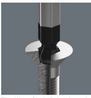
The Wera Black Point tip and a refined hardening process ensure long service life of the tip, improved corrosion protection and an exact fit.