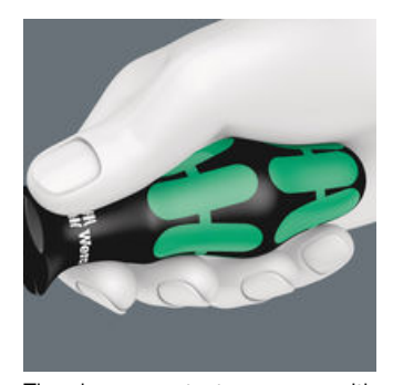
The large contact area - with particularly high friction to the soft zones - results in high torque transfer without any bruising from the edges.