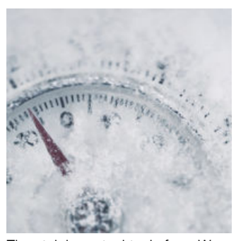
The stainless steel tools from Wera are vacuum ice-hardened and have the hardness and strength needed for screw connections. There are no limitations to the industrial applications they are suitable for.