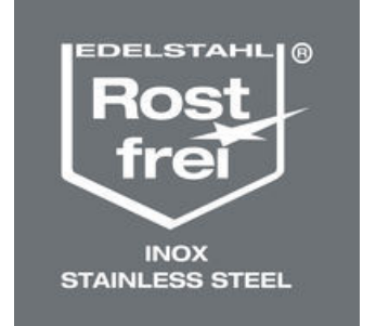
Stainless L-keys are hardened to the same strength as conventional (carbon) steel tools, and prevent extraenous rust forming.