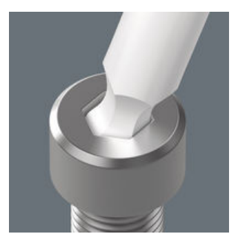
The spherical drive profile means that it is possible to swivel the axis of the tool to that of the screw, and therefore enable angled, "around-the-corner" screwdriving jobs.

Hexagon screws can endure a problem because the contact surfaces delivering the power from conventional tool, the is transferred to the screw via very small surface areas. The consequence: the screw can become damaged (rounding out). Hex-Plus tools have a greater contact surface that prevents this from happening! At the same time, as much as 20 % more torque can be applied. Good to know: Hex-Plus tools fit into every standard hexagon socket screw!