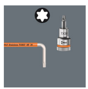
Take it easy tool finder system with profile and size colour-coding for quick and easy tool selection. Colour-coded system for hexagon drive screws (L-Keys, Zyklop bit sockets), external hex drive screws and nuts (Joker wrenches, Zyklop sockets and Zyklop bit sockets with holding function), and TORX(® drive screws (L-Keys, Zyklop bit sockets).