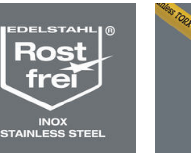
Stainless L-keys are hardened to the same strength as conventional (carbon) steel tools, and prevent extraenous rust forming.